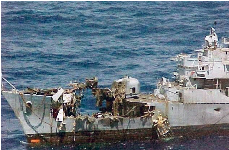
Figure 5. Damage to USS Buchanan from two Harpoon missile hits