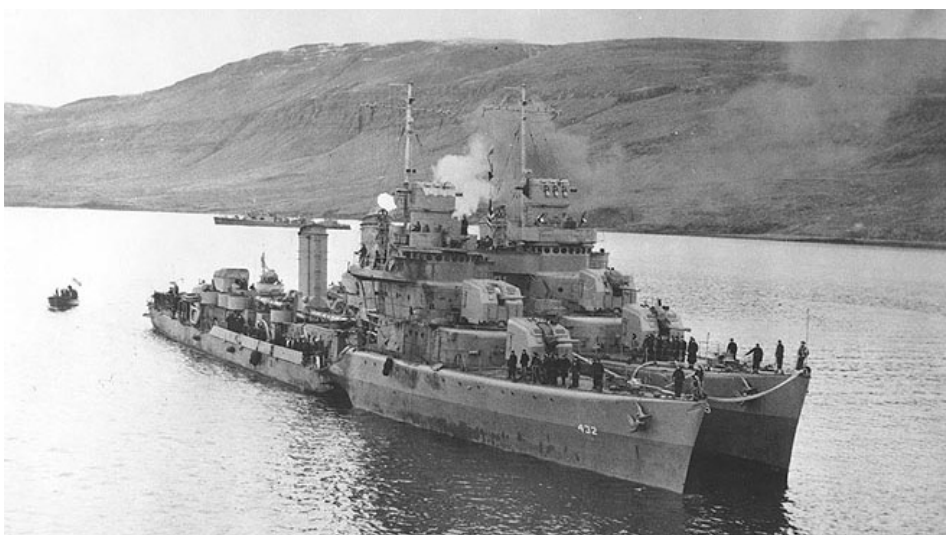
Figure 1. Torpedoed USS Kearney alongside USS Monssen, Oct 1941

Benson/Gleaves class displacement: 1,839 tons Old damage point value: 72 New damage point value: 128 G7a damage: 88