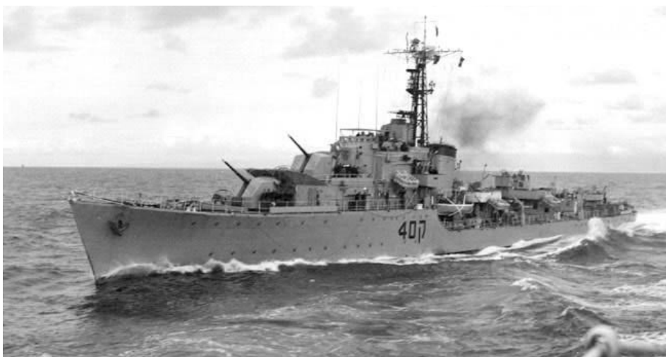
Figure 3. INS Eilat

USS Kearney was hit amidships, however, because the torpedo had difficulties maintaining depth, it hit the destroyer very near the surface (see Figures 1 and 2). The shallow hit allowed a lot of the blast energy to be vented into open air, instead of being tamped by several meters of water and directed toward the hull. With only one fireroom flooded, Kearney limped to Iceland for emergency repairs before setting sail for Boston in late December.