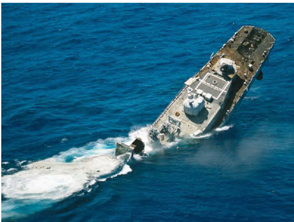
Ex-USS Buchanan finally goes down

Looking for solutions inside the model, the bomb might have inflicted enough damage to sink Buchanan, but the "sinking roll," the time taken to actually disappear after inflicting fatal damage, might have been too long. The die roll is 3D6 Tactical Turns, or a maximum of 54 minutes. Were they just impatient to finish the event? Almost certainly not.