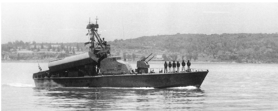
Figure 4. Russian Project 183R [Komar] missile boat www.militaryimages.net/forums/archivel/index.php/t-9250.html

First off, although three warshot Harpoons were reported to have hit her, a little ditty on the Buchanan SINKEX web page ( http://www.uss-buchanan-ddg14.org/Sinkex/index.htm ) states that the third Harpoon flew through the hole made by the first two (Figure 5, page 16). Removing one Harpoon warshot (we didn't count the two missiles with telemetry modules) from the damage leaves Buchanan taking 153 damage points - about 91% of her rated value. The key point here is that the ship had an extremely small chance of staying afloat, but at least it had a chance. With the previous damage equation, even removing one warshot Harpoon, the ship should have had no chance of staying afloat.