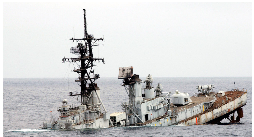
USS Towers sinking